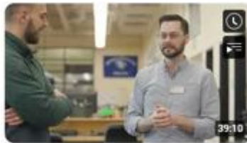
Ridgewater Nondestructive Testing (NDT) Program Deep Dive

Discover what our Massage Therapy program is all about!