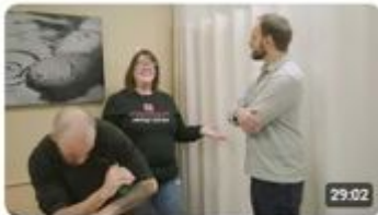
Ridgewater College Massage Therapy Program Deep Dive

Discover what our Massage Therapy program is all about!