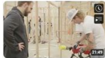
Ridgewater College Plumbing Program Deep Dive

Discover what our Non-Destructive Testing program is all about!