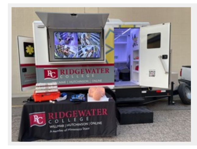
Ridgewater College Expands Training Range for Truck Drivers

A new mobile ambulance simulator arrived just in time for fall semester for our EMT and Paramedic programs to use. Ridgewater is proud to offer stateof-the-art facilities for our programs.