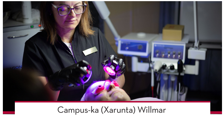
Campus-ka (Xarunta) Willmar