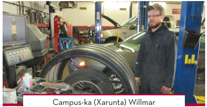
Campus-ka (Xarunta) Willmar