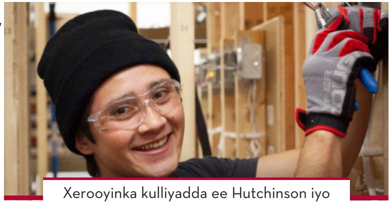
Xerooyinka kulliyadda ee Hutchinson iyo Willmar