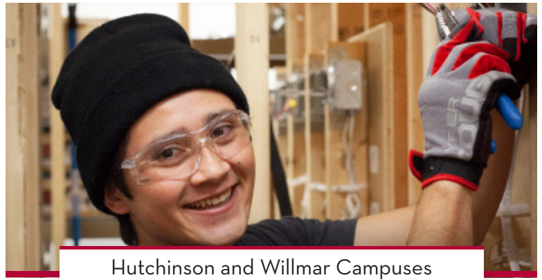
Hutchinson and Willmar Campuses