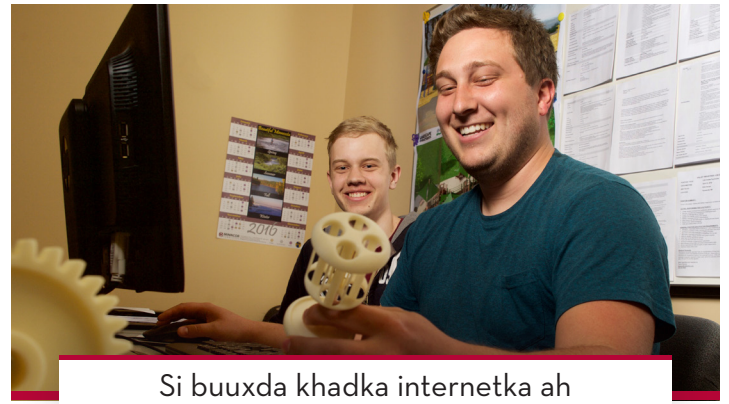
Si buuxda khadka internetka ah