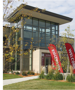
WILLMAR CAMPUS 2101 15 th Avenue NW Willmar, MN 56201

Ridgewater College, A member of Minnesota State