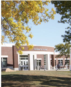
HUTCHINSON CAMPUS 2 Century Avenue SE Hutchinson, MN 55350

Ridgewater College is a student-centered educational leader focused on innovation, excellence and affordability.